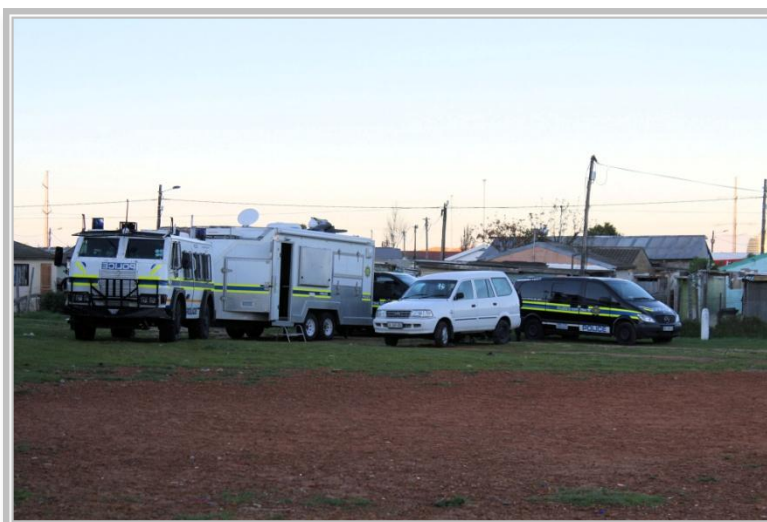
Photo 6: The South African Police Service and the Public Order Police have set up a venue operations centre on the field outside the Community Hall

An event of this nature requires the support, cooperation and coordination of a whole range of groups and individuals. They included: the South African Police Service, the Public Order Police, the Police from the local community of Lwandle, the Dog Unit, the Traffic Department, and the Military Police (responsible for marking the route, escorting the convoy and crime prevention).