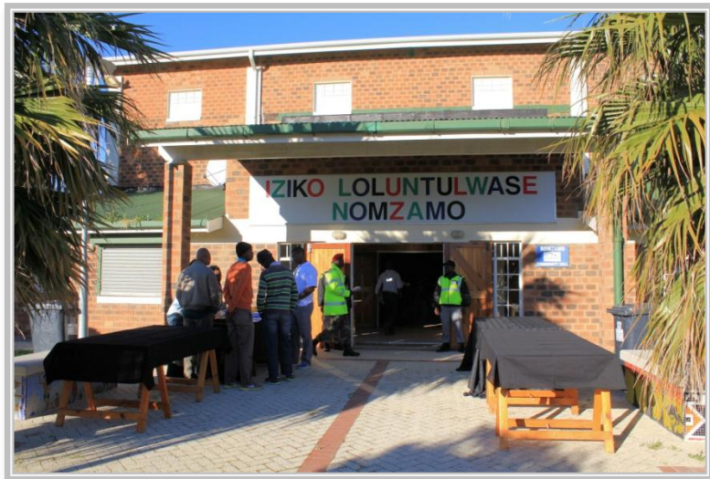
Photo 5: The Community Hall in Nomzamo outside the Strand hosts the Defence Review Committee's final public imbizo

Hundreds of copies of magazines, including the latest Reserve Force Volunteer of Winter 2012, were handed out that day. The younger children particularly enjoyed looking at the colourful pictures, and proudly showed off their copies of these magazines.