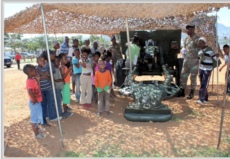
Photo 15: The children form an orderly queue, eagerly waiting for a chance to peer through the sights of the Cape Field Artillery's 25-pounder gun