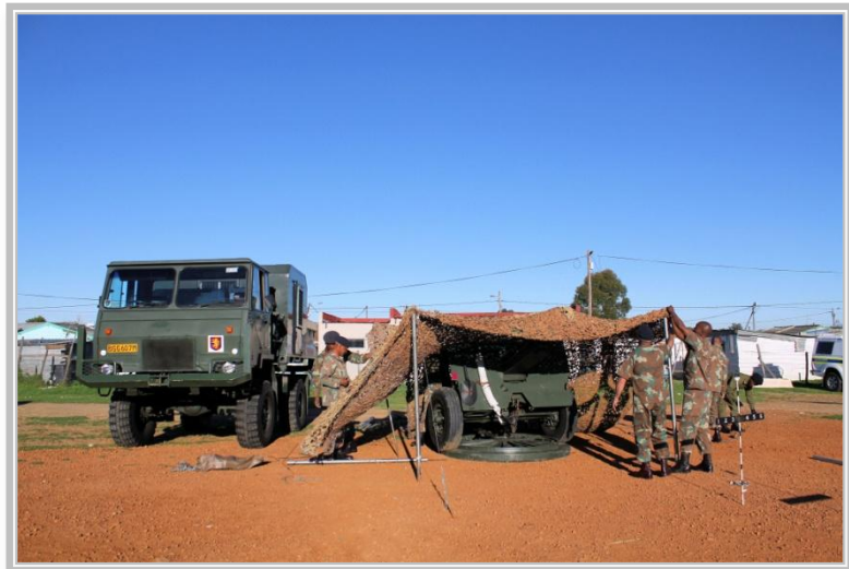
Photo 9: The CFA soldiers drape camouflage netting over their 25-pounder gun, which stands alongside their SAMIL 20 gun tractor

All the visitors and spectators were given an unexpected treat in the form of a thrilling performance by the sixteen men and women of the Cape Field Artillery Pipes and Drums. Looking very smart in their scarlet Royal Stewart tartans, brilliantly white shirts and black vests, they were led out by Pipe Major Staff Sergeant Andrew Imrie. Forming into a circle, the group was quickly surrounded by inquisitive children and teenagers, many of whom had