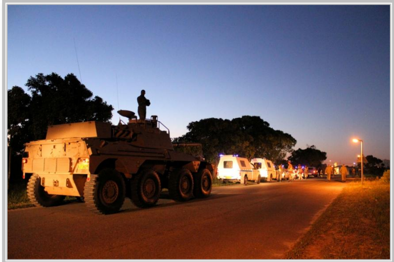
Photo 1: The convoy of military vehicles assembles at Fort iKapa in the pre-dawn darkness before sunrise.

On Saturday, 15 September 2012, the Defence Review Committee (DRC) held the final imbizo of their public participation process at Nomzamo community hall near The Strand outside Cape Town. An important role in this event was played by various Regular and Reserve Force units of the SANDF in the Western Cape, which set up a static display outside the hall to give the community an opportunity to interact with the soldiers.