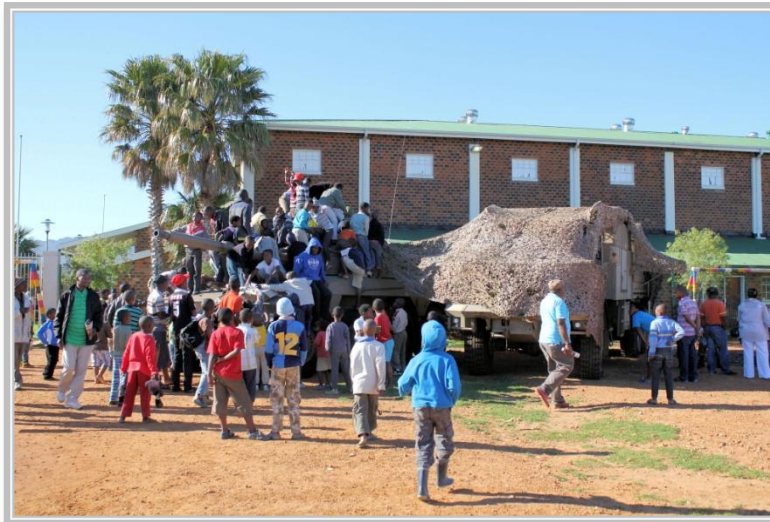
Photo 11: Members of the public clamor excitedly all over the Rooikat armoured vehicle of Regiment Oranje Rivier – this is clearly one of the most popular displays

In the succeeding months, the DRC looked closely at the current state of the SANDF and its role in South Africa and beyond, in preparation for defining the thematic areas and drafting an initial Defence Review 2012. On 12 April 2012, Minister Sisulu made public this draft document.