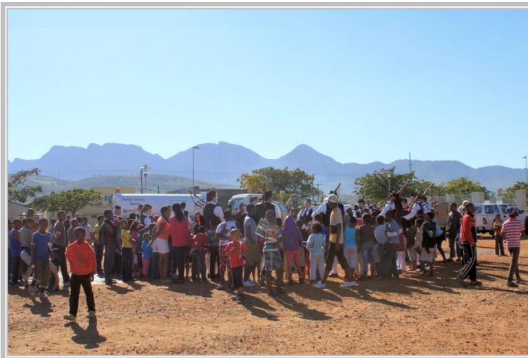
Photo 14: The band is immediately surrounded by curious spectators; the youngsters reward the drummers and pipers with much cheering and applause

Many of the attendees expressed gratitude to the committee for taking the time to consult with the community and to listen to their questions. However, the overall sense was one of