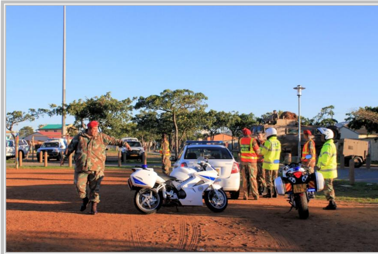
Photo 7: WO2 Andy Keet instructs the Military Police to secure the perimeter of the field while the displays are being set up

Bay and The Strand. Up to 960 people had been invited, and close on 800 ultimately attended this event.