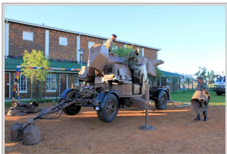
Photo 8: The soldiers of Cape Garrison Artillery skilfully set up their Oerlikon 35 mm anti-aircraft cannon with precision and teamwork

Before the day's formal programme began, the members of the DRC were shown around the static displays of the various participating regiments. The members of the committee were pleasantly surprised, as they had not expected such a large and impressive display. The personnel on duty at the various displays were praised by all of the committee members for their high standards and professional behaviour. The committee members remarked that their reception, the quality of the displays and the number of people from the community who participated in this event made this final imbizo the best they had attended. This