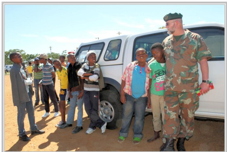
Photo 20: The soldiers have made a very positive impression on the younger generation, with their professional and disciplined demeanour, as well as their friendliness and willingness to engage with the youth

The professionalism, discipline and friendliness of the soldiers who attended the event had definitely made a positive impact on the community, and especially on the younger generation, with whom they engaged that day. The community expressed a strong urge to see more of the Defence Force in the communities, and specifically to become involved with the youth, by contributing to youth development, establishing high morals, ethics and discipline among the new generation, and thus fostering nation-building.