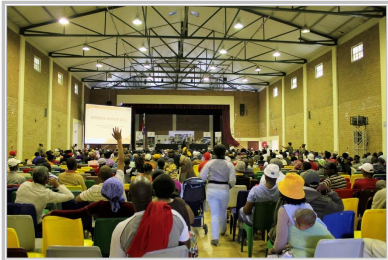
Photo 17: There are around 800 people attending this public imbizo – and they have many questions for the Committee

was that of illegal immigrants entering South Africa, even though the Defence Force is responsible for protecting the borders. Mr Meyer reminded attendees that South Africa has extensive borders – 4,400km on land and about 4,000km of coastline – and that the SANDF simply does not have the resources to patrol along all the borders. The situation is complicated by the fact that other agencies are involved too, namely, the South African Police Service and the Department of Home Affairs, which must verify that immigrants are indeed legitimate asylum seekers.