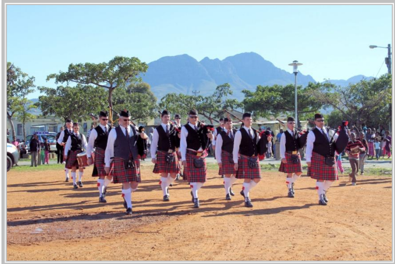
Photo 13: The Cape Field Artillery Pipes and Drums surprise the community with a stirring performance